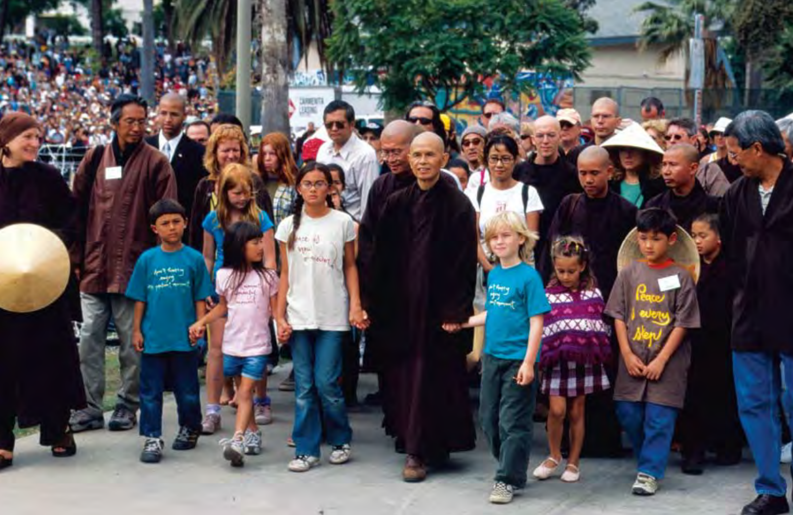
Thich Nhat Hanh leads a peace march in Los Angeles in 2006. He is considered the founder of Engaged Buddhism.

diplomatic, economic, and eventually military—would ensure the survival of the South Vietnamese government.